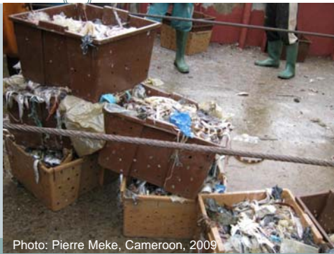
Cameroon, 2009