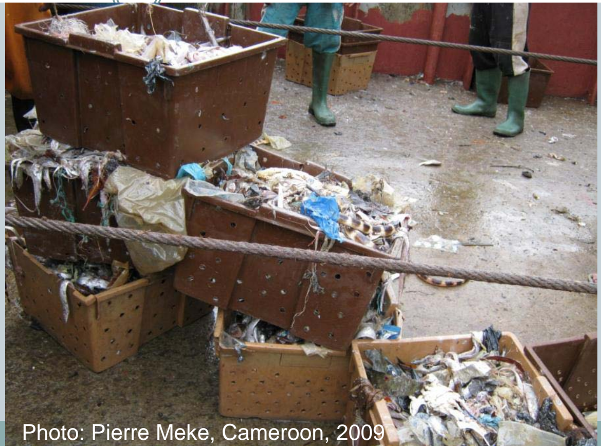
Cameroon, 2009